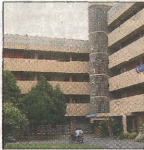
A file photo of IIT, Delhi.

Almost all the departments of IIT-D had more than 150 exhibits for over 1,500 visitors from prominent corporate world entities that included IBM, NIIT, Cadence, Calypto, Applied Electro Magnetics, Indian Airlines, C-DAC.